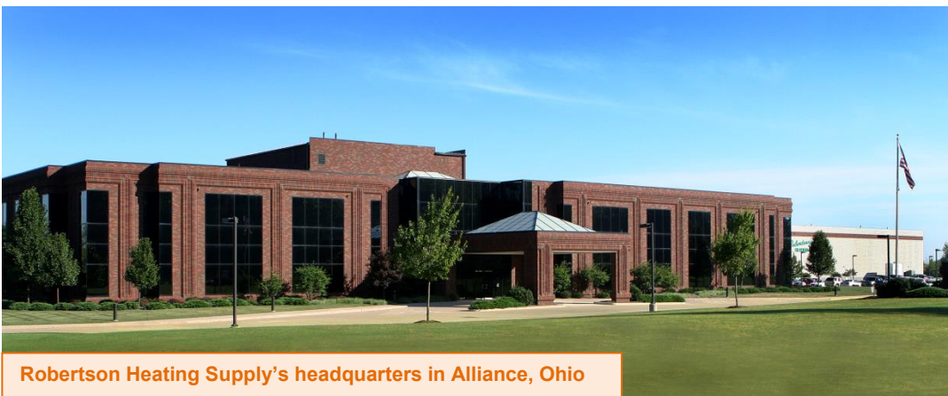
Robertson Heating Supply's headquarters in Alliance, Ohio